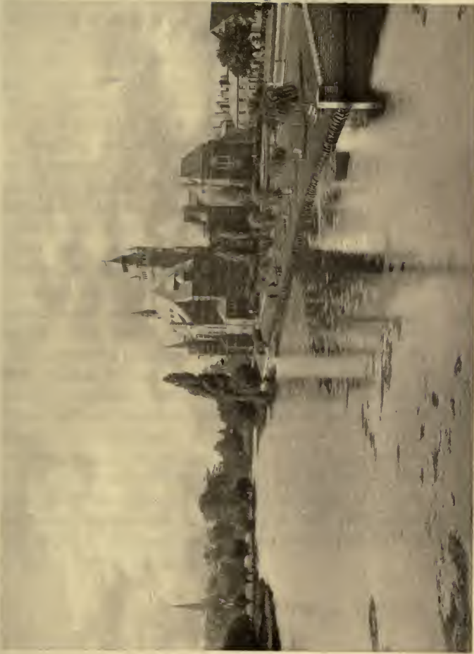
Copyright 1912 by W. H. Allen & Co. Boston